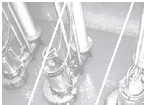
Transport & Treatment