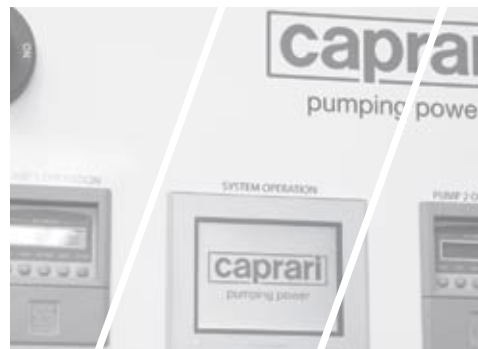
Pump Control Technology