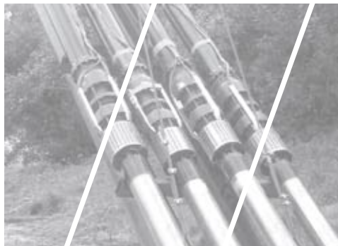
Collection & Distribution

CAPRARI SPA Modena (Italy) • CAPRARI FRANCE SARL Maurepas - Paris (France) • BOMBAS CAPRARI SA Alcalà de Henares Madrid (Spain) • CAPRARI PUMPS (U.K.) LTD Peterborough (United Kingdom) • CAPRARI PUMPEN GMBH Fürth/Bayern (Germany) • CAPRARI PORTUGAL LDA Santarém (Portugal) • CAPRARI PUMPS AUSTRALIA PTY LTD Beverley SA (Australia) • CAPRARI HELLAS SA Thessaloniki (Greece) • CAPRARI TUNISIE SA Ben Arous (Tunisia) • CAPRARI PUMPS (SHANGHAI) CO LTD Shanghai (People's Republic of China) • CAPRARI PUMPS NEW ZEALAND Christchurch (New Zealand)