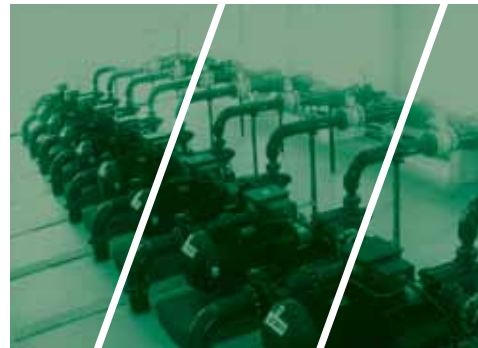
Boosting & Distribution